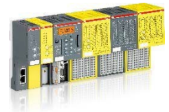
AC500-S & S500-S I/O