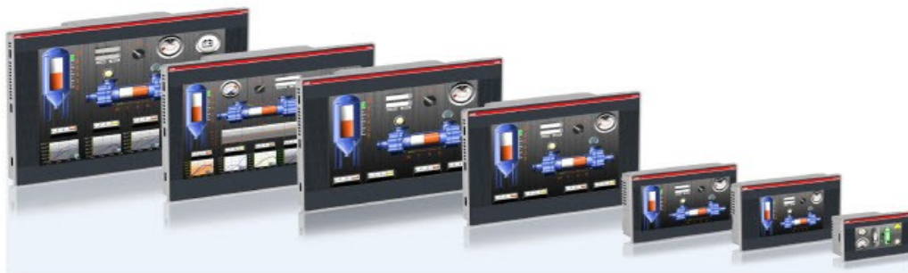
CP600 & CP600-WEB