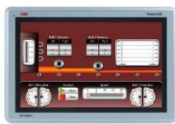
High Performance Panels