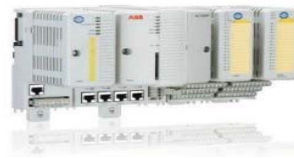
AC800 HI & S880 I/O